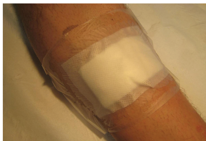
Photo 3: Applying Secuderm® after refection of an abscess dressing. Harpy 2009. Maripasoula, Guiana, France.