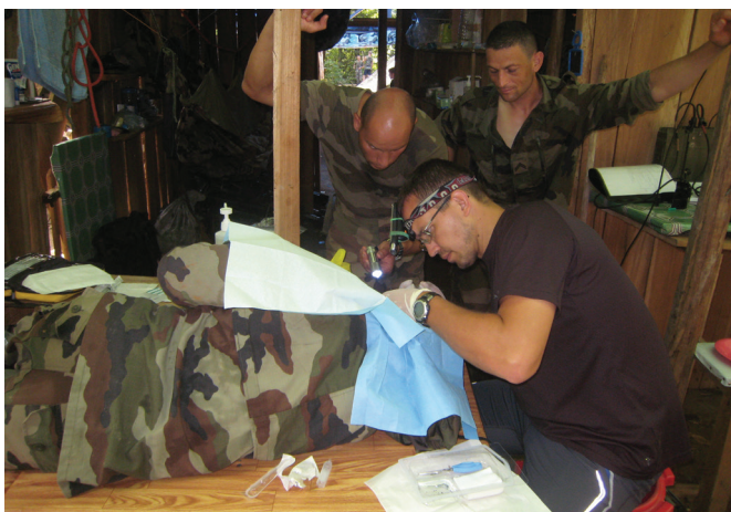
Photo 4: Minor surgery in an exceptional situation in camp Dorlin. Harpie 2009. Guiana, France.

On the occasion of the operation Harpie in 2009 [4;5], fighting against illegal gold washing in the Guyanese forest, we have tested it six times during a period of two months while in the equatorial forest. The dressings were installed by a doctor or nurse on wounds in complete detersive phase. Patients went on patrol for a period of few hours to maximum three days. Secuderm® covered most often a primary dressing of Vaseline-Jelonet® type, tulle-compress fixed by a self-adhesive tape of Hypafix® type (specialty staffing in the Army).