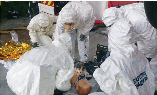
Photo 6: Using high fidelity simulation (SimMan 3G®) by the Paris Fire brigade to practice management of victims of neurotoxic projection in the subway.

- The absorbent dressings placed on exuding wounds (hydrocellular, hydrocolloids, alginates, etc.) may be finally brought to saturation, in a hospital setting or in homecare. Interventions on a wound are reduced, improving patient comfort for an optimized healing and cost management.