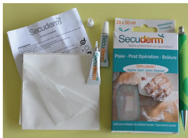
Photo 1: Secuderm®: bag, leaflet, applicator tube and its pre-assembled cannula with the transparent polyurethane film on its support paper (here in the version 20 x 30 cm). SSA\HLeFort®