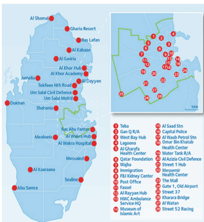
Figure 1: Map of Qatar showing the current different ambulance spoke stations.

The aim of the pilot study presented in this article is to highlight the differences in response times within Doha (urban setting) compared to the rest of the country (rural setting), and identify any causal trend in the slower response times observed during a set period of time, whilst also discussing how technology can impact on response times.